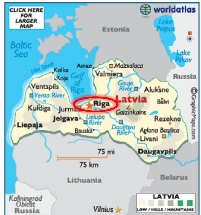
Figure 3. Map of Latvia. https://www.worldatlas.com/webimage/countrys/europe/lv.htm