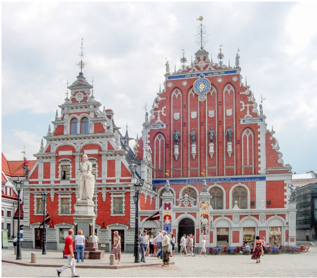
Figure 2. The building of the Brotherhood of Blackheads is one of the most iconic buildings of Old Riga.