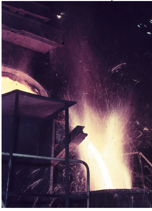
From inside the Mill in Hofors