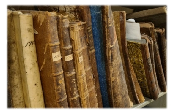
Hofors archives: notebooks from the mine, showing actitvity dating back to 1740.

The majority of Hofors residents we spoke to have both a positive attitude towards the project and a great deal of confidence in its success. They believe that this change will provide workers with an assurance of stable employment, as well as potentially generate some new jobs. Primarily they believe it will lead to a greater degree of economic stability in Hofors, partially revitalising the town and assuring its survival. Though there is a hope that the new technology can lead to social and economic revitalisation, no one believes that Hofors can return to its Golden Age.